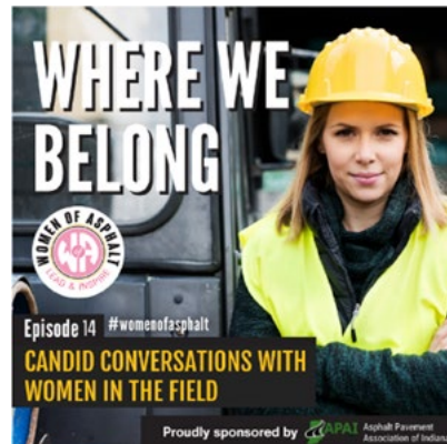
Candid Conversation with Women in the Field