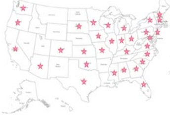
Participation in 31 states